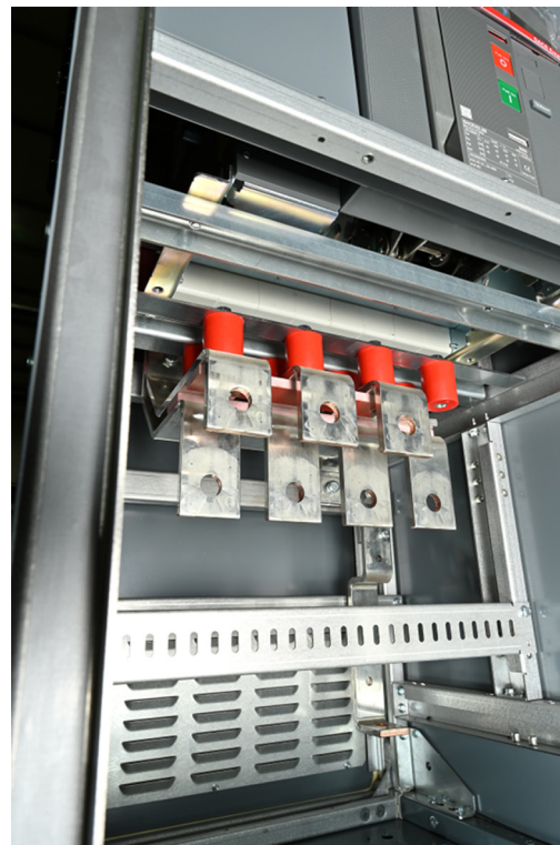
Power Cable Termination Provisions