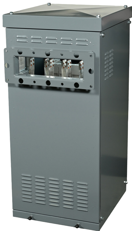
Bus Duct or Transformer Connection